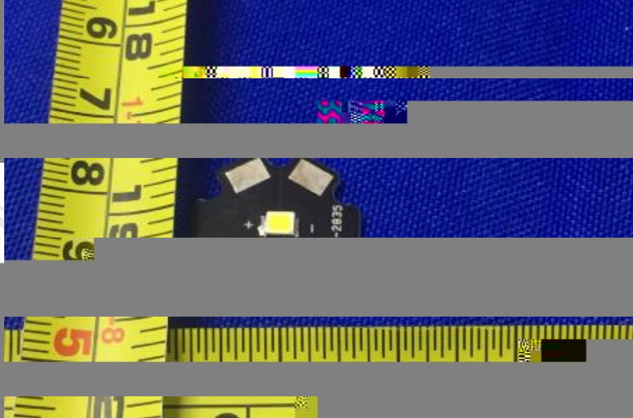
Fig. 1 - Overall view of the sample